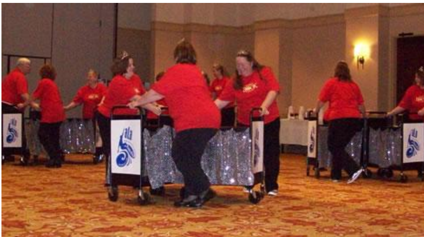
Delaware Diamonds perform live at the 2008 DLA Conference.