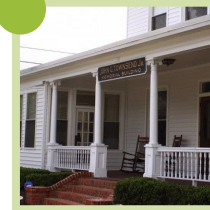
Selbyville June 2004 $state: 423,500 SF 5,600