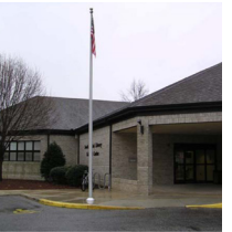
South Coastal May 2009 $state: 4,224,400 SF 20,000