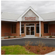
Frankford November 2013 $state: 365,000 SF 6,200