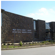
Brandywine April 2003 $state: 4,422,900 SF 40,000