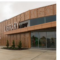
Route 9 September 2017 $state 13,066,000 SF 43,000