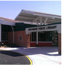
Greenwood June 2014 $state: 1,875,000 SF 10,400