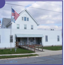
Harrington $state:2,600,000 SF 2,000 Proposed SF 18,000