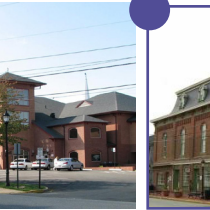
Milford November 2010 $state: 2,291,400 SF 21,940