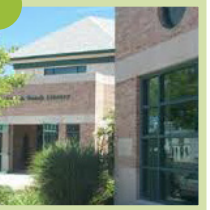
Rehoboth 2000 $state: 754,000 SF 11,000