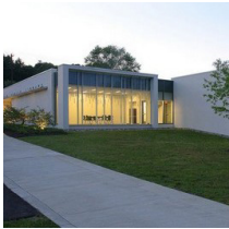
Hockessin April 2008 $state: 4,001,100 SF 23,000