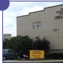
N. Wilmington SF 6,318