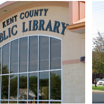
Kent County 2010 $state: 0 SF 10,000