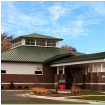
Bridgeville September 2009 $state: 1,537,000 SF 13,490