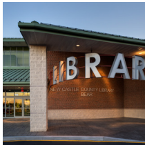
Bear January 2013 $state: 4,052,250 SF 25,000