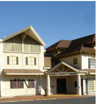
Milton 2005 $state: 948,800 SF 16,676