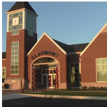
Claymont October 2013 $state: 5,009,357 SF 17,500