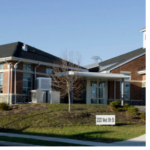
Woodlawn September 2006 $state: 3,038,000 SF 17,600