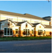
Georgetown August 2010 $state: 3,260,000 SF 29,000