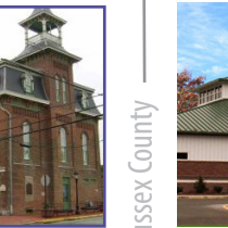
Smyrna (Duck Creek) $state: 4,400,000 SF 4,918 Proposed SF 25,000