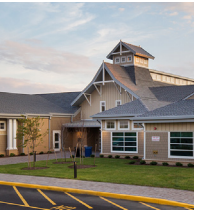
Lewes June 2016 $state: 6,250,000 SF 28,502