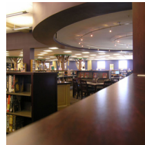
New Castle March 2010 $state: 3,308,800 SF 23,000