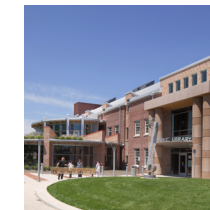
Dover September 2012 $state: 10,976,000 SF 46,000