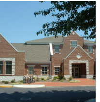
Laurel May 2006 $state: 1,943,500 SF 26,000