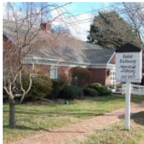
Corbit-Calloway 1997 $state: 13,200 SF 6,100