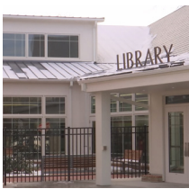
Delmar Dedication April 2019 $state: 2,800,000 SF 15,000