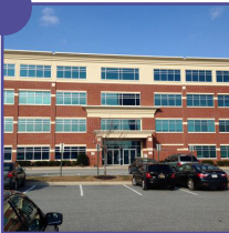
Appoquinimink/ Southern Regional September 2007 SF 10,000