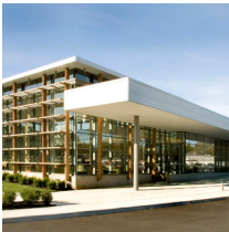
Kirkwood August 2008 $state: 3,580,700 SF 22,500