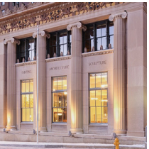
Wilmington January 2014 $state: 5,063,000 SF 45,592