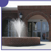
Seaford December 2009 $state: 3,127,000 SF 16,800