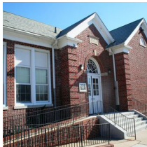
Delaware City September 2003 $state: 1,675,000 SF 13,000