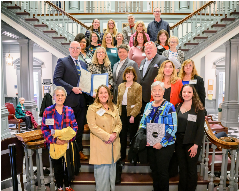
Delaware librarians, library supporters, and legislators pose with Senate Concurrent Resolution 28 (SCR38)