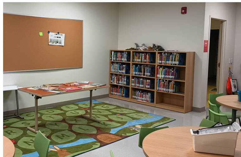
Above: Library for kindergarten through 2nd grade