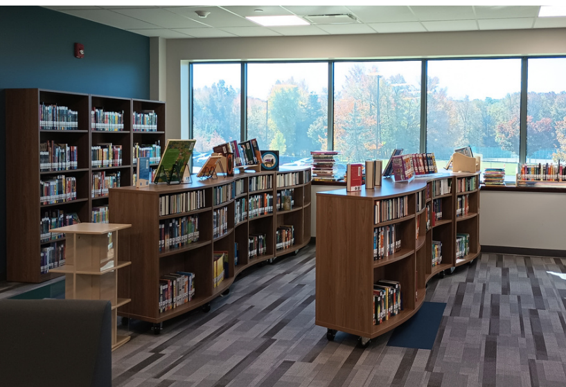
Left: Library for middle school grades