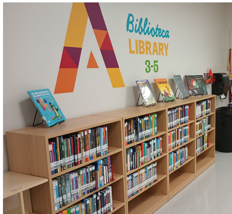
Library for 3rd through 5th grades