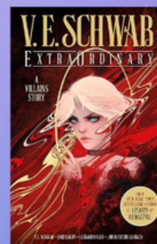
Teen Readers Graphic Novel