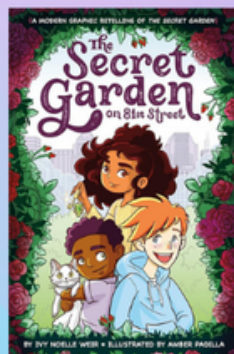
Middle Readers Graphic Novel