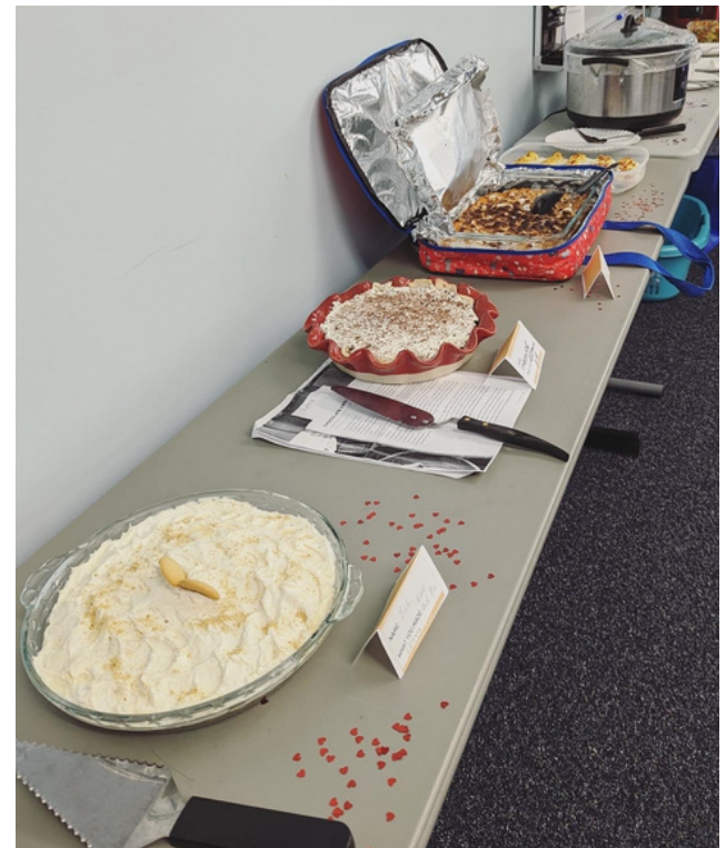
Desserts, deviled eggs, and so many crockpots!