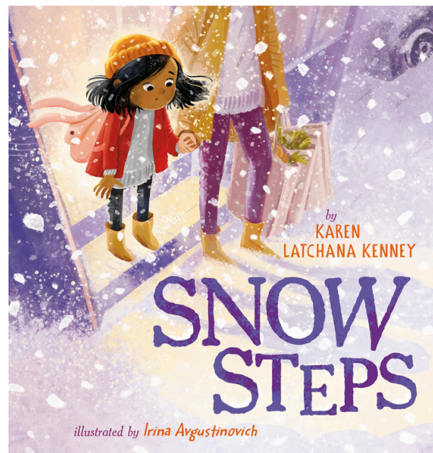
One of the current candidates for the Delaware Diamond Book Award